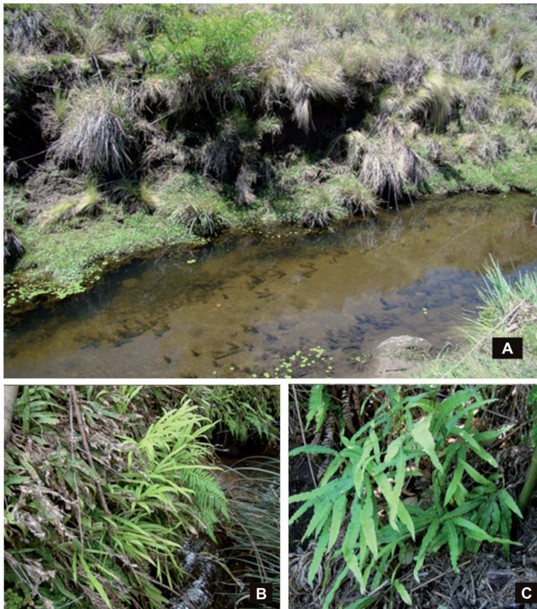
Fig. 2. Pteris cretica populations in the Comechingones biogeographic province. A) Habitat of Pteris cretica . B) Population of Pteris cretica var. laeta occupying the habitats of native ferns as Adiantum raddianum and Amauropelta argentina . C) Fertile specimen of Pteris cretica var. laeta .

buchtienii (Rosenst.) R.M. Tryon, Blechnum auriculatum Cav., Amauropelta argentina (Hieron.) Salino & T.E. Almeida and Adiantum raddianum C. Presl native species (Figure 2). The species Pteris cretica is also found as ruderal in modified, urban environments of Buenos Aires province. According to Yañez, Gutierrez & Ponce (2020), it is a very common species in disturbed and ruderal environments, such as roadsides or humid walls. It is registered as an apogamic species (Martínez, 2010) and, probably, this characteristic is related to the almost cosmopolitan distribution of the species and the facility to colonize new environments (Yañez et al. , 2020). In Argentina the species is also mentioned in Malvinas archipelago (Martínez, 2011;